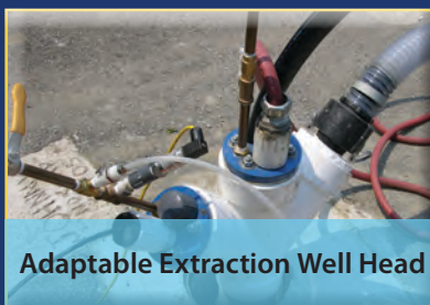
Adaptable Extraction Well Head