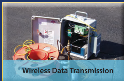
Wireless Data Transmission