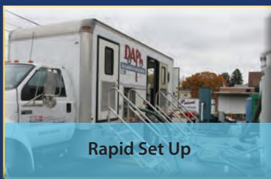
Rapid Set Up