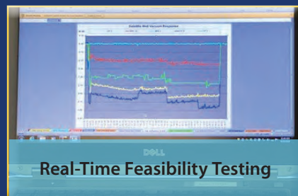
Real-Time Feasibility Testing