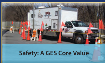
Safety: A GES Core Value