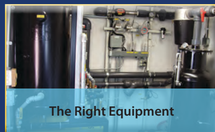
The Right Equipment